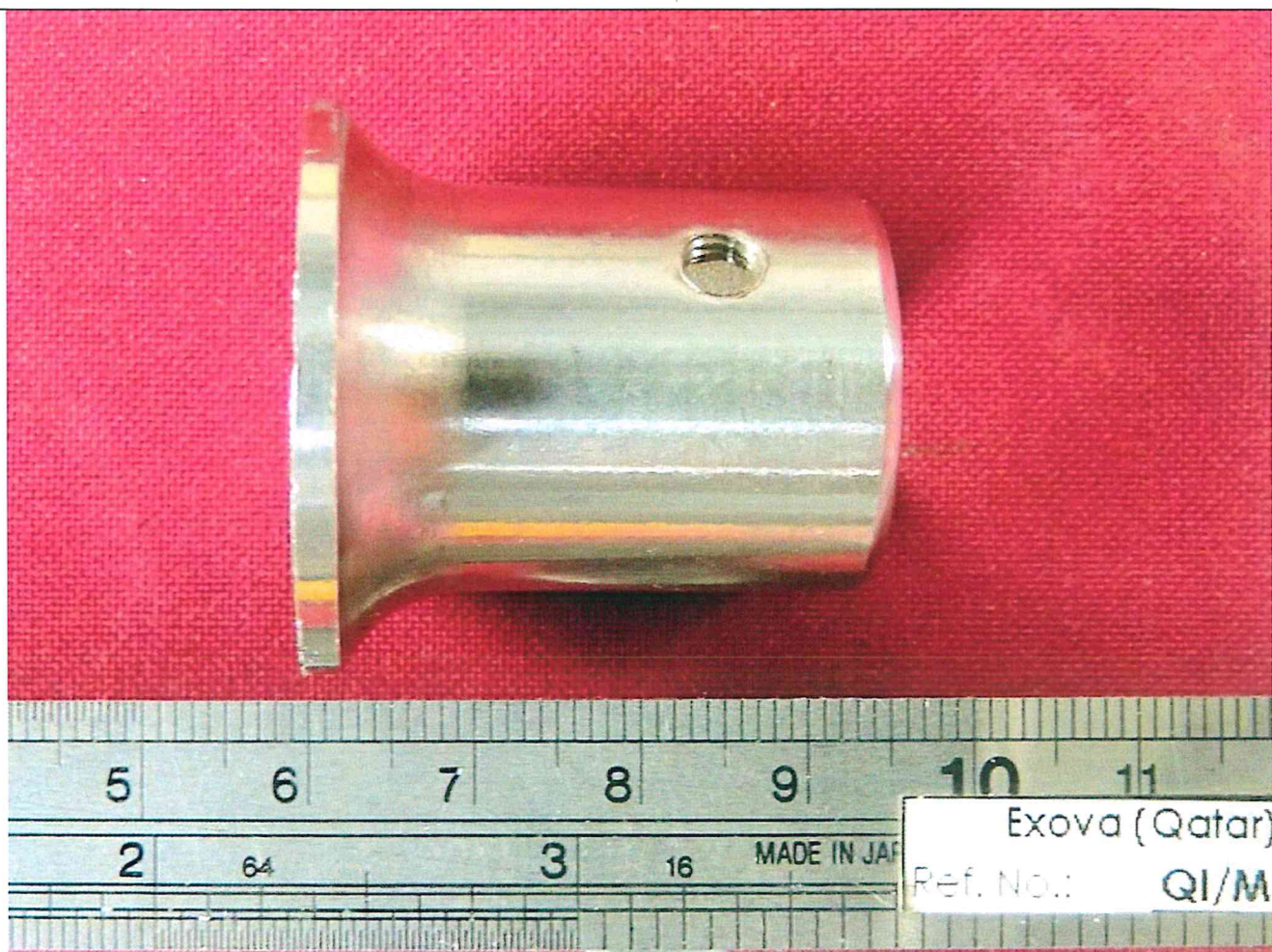
Figure 1: Photograph showing as-received condition of Pipe-Valve Connector for PMI testing.