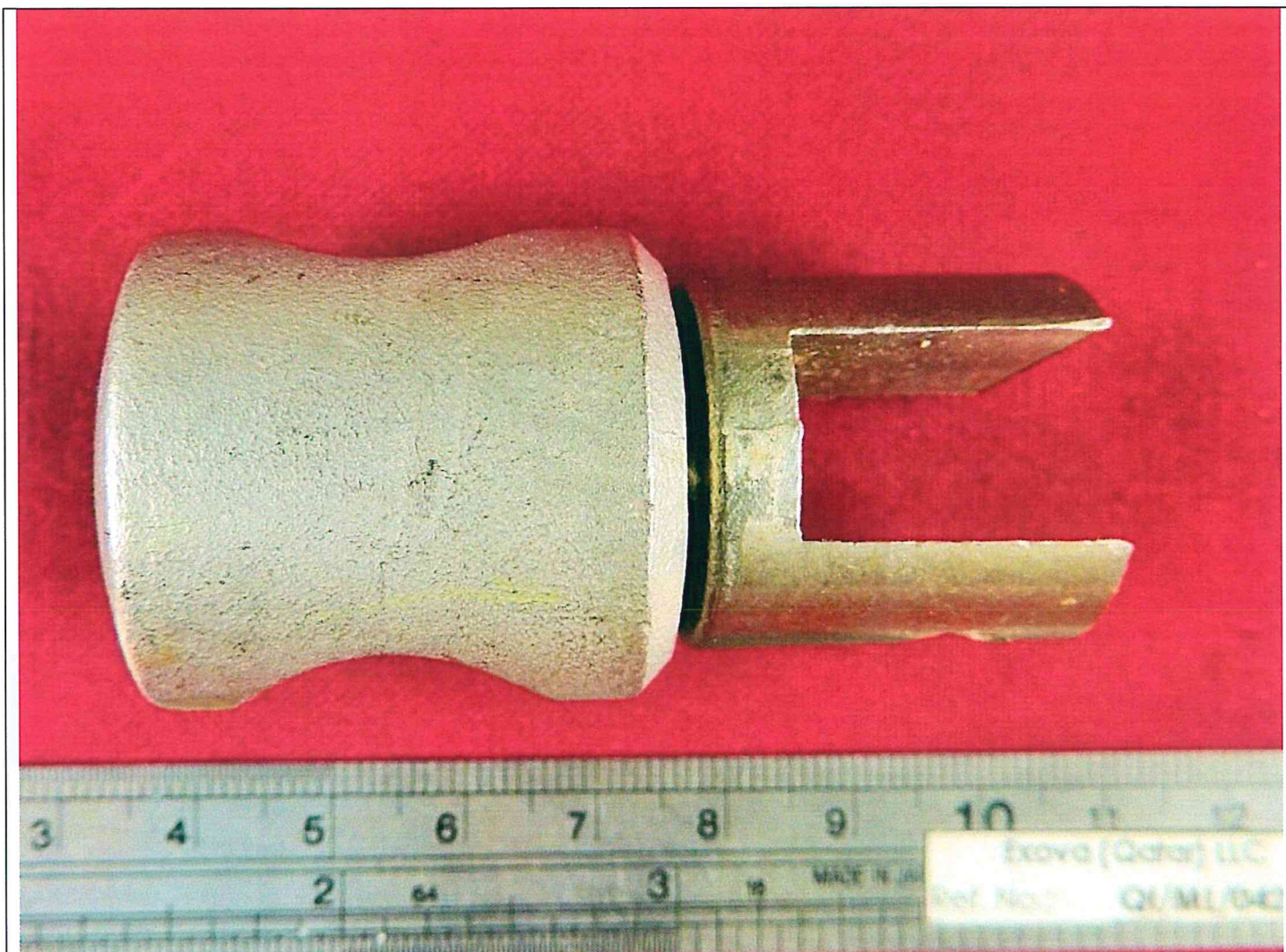
Figure 1: Photograph showing as-received condition of Pipe-Glass Connector sample for PMI testing.