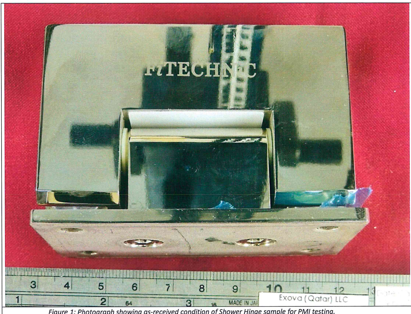
Figure 1: Photograph showing as-received condition of Shower Hinge sample for PMI testing.