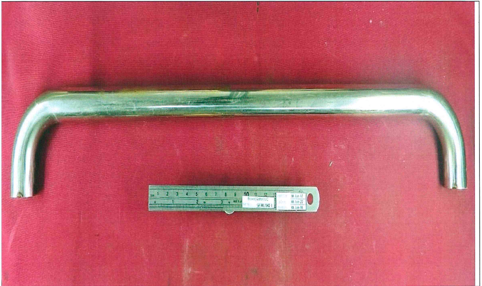
Figure 1: Photograph showing as-received condition of Handle sample for PMI testing.